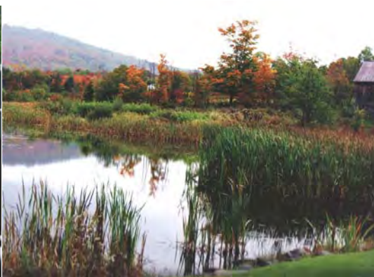
September: Star Lake Tranquility By Craig Tomkinson