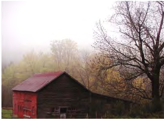
^ Cover: Foggy Morning Farming By Jacob Mailhiot