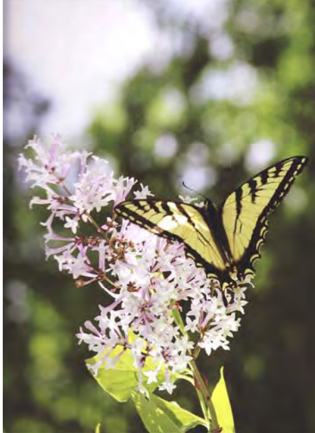
First Page: Lilac Rider By Karen Berger >