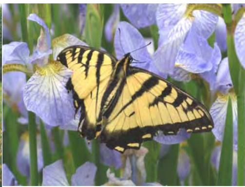
June: Swallowtail Resting on Iris By Pat LaBella