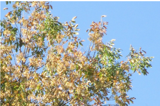
Hope for the survival of ash species depends on fresh seeds to start a new generation.

Think big. Take action. Encourage your town to plan ahead for EAB. By addressing issues before EAB arrives, the loss associated with an infestation can be spread over a longer period of time. Neighboring communities can coordinate to share resources and reduce costs. See https://vtcommunityforestry.org/community-planning/tree-pests for more information.